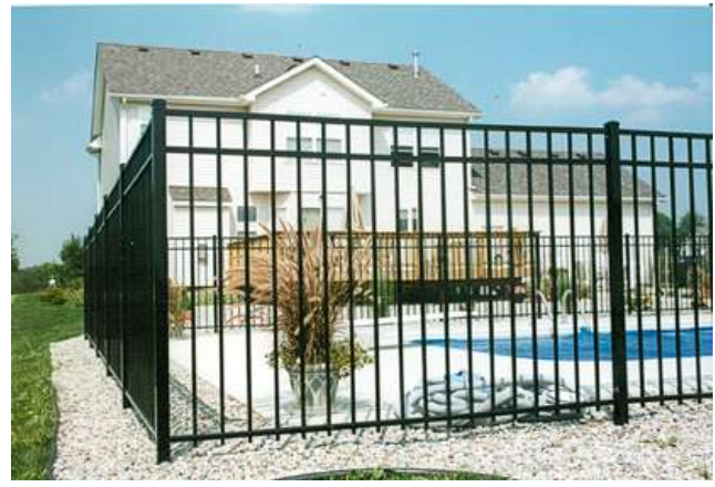
Fence Style #3 – Metal Fence-Black Aluminum