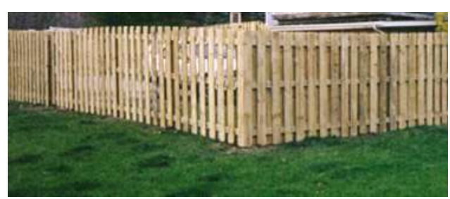
Fence Style #1- Shadowbox