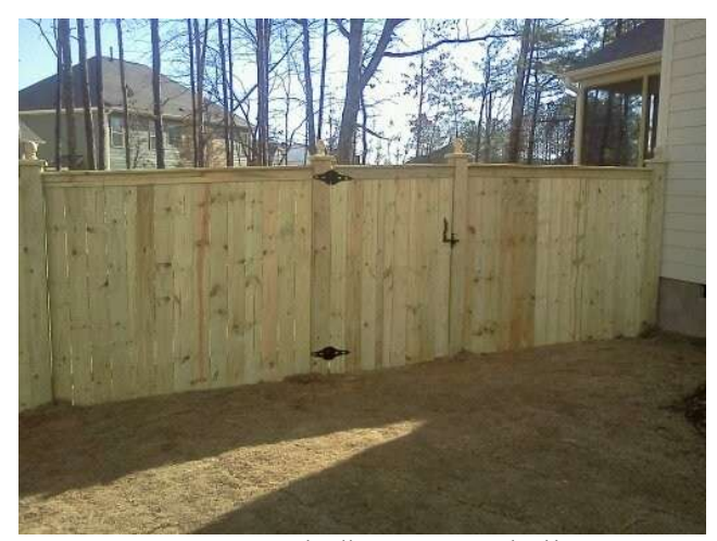
Fence Style #2 - Cannonball