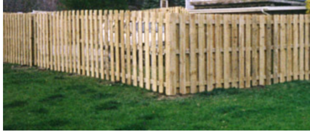
Fence Style #1- Shadowbox

***Chain Link Fences are not allowed.***