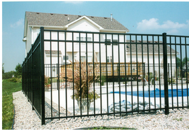
Fence Style #2 – Metal Fence-Black Aluminum