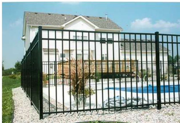
Fence Style #3 – Metal Fence-Black Aluminum