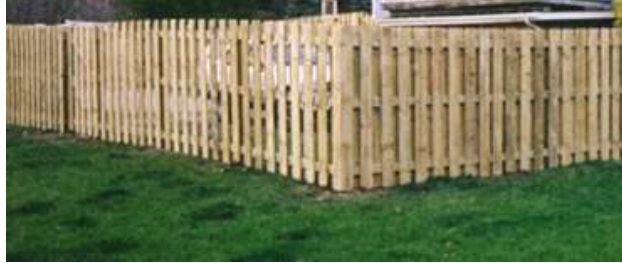
Fence Style #1- Shadowbox

***Chain Link Fences are not allowed.***