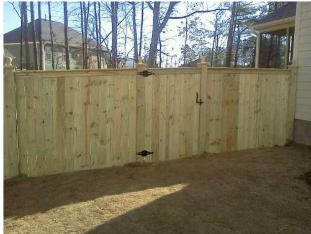
Fence Style #2 - Cannonball